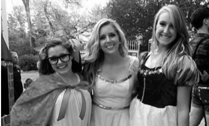
Mu collegians in their Homecoming skit costumes.

After Thanksgiving we had a unique sisterhood event. A movie theatre was rented and the chapter watched the premiere of the latest movie in the Twilight series. A special thank you to members of the Kansas City alumnae chapter. Your donation to Mu Chapter made the evening possible. We ended the school