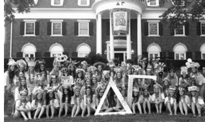
Beta Kappa welcomes new members on Bid Day.